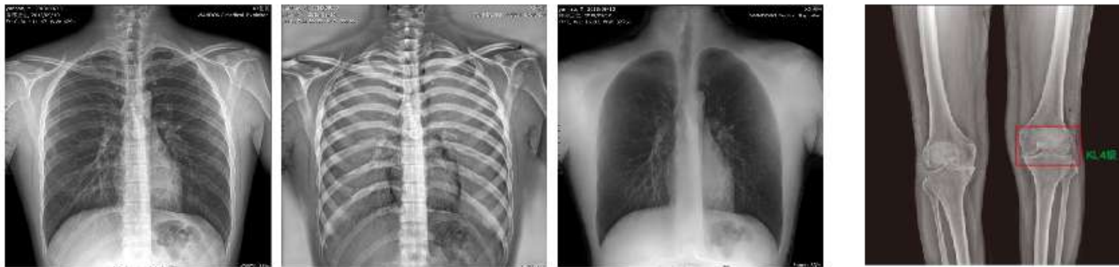
Intelligent bone suppression function